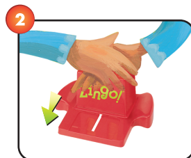
2 Push the top forward.