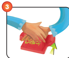
3 Pull the top back.