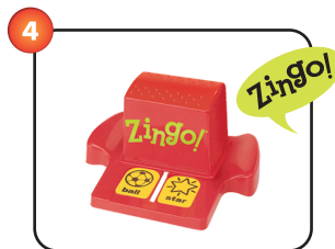
4 The Zingo!® tiles are revealed.